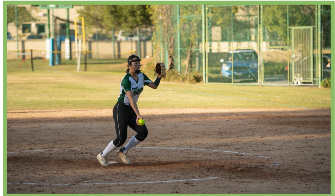
RICHARD N. FRANK ATHLETIC FIELD