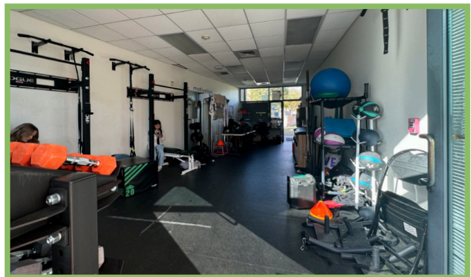
THE STUDENMUND FAMILY WEIGHT TRAINING ROOM